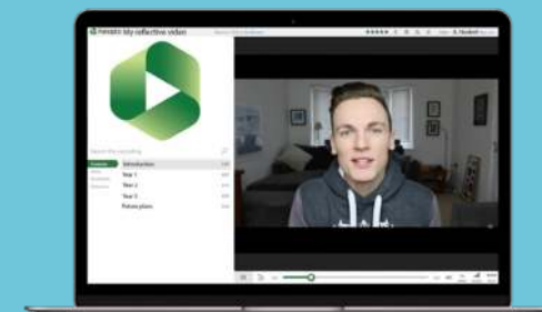
Above: Videos are uploaded, viewed, and feedback can be given via Panopto.

Additional Tip: If you would like to provide video feedback via Panopto, the Digital Education Team can help you facilitate this for each individual student.